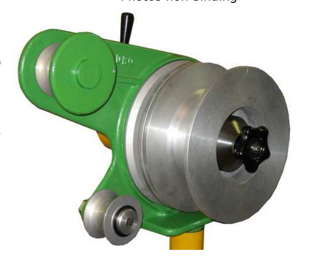
Exists in PORT or STARBOARD model

The line hauling is free from the disconnected drum and the turn is helped by the controlled brake.